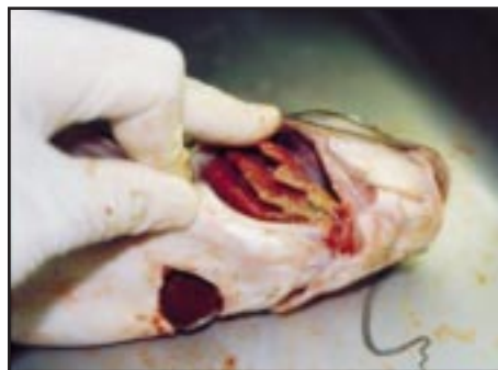
Figure 1. Yellow pigmented columnaris bacteria have infected the gills of this channel catfish, causing erosion.

Fish with columnaris usually have brown to yellowish-brown lesions (sores) on their gills, skin and/or fins. The bacteria attach to the gill surface, grow in spreading patches, and eventually cover individual gill filaments (Fig. 1). This results in cell death. Portions of the gills are eroded by protein- and cartilage-degrading enzymes produced by the bacteria. Skin lesions produced by columnaris initially are very shallow and may appear as an area that has lost its natural shiny appearance. More